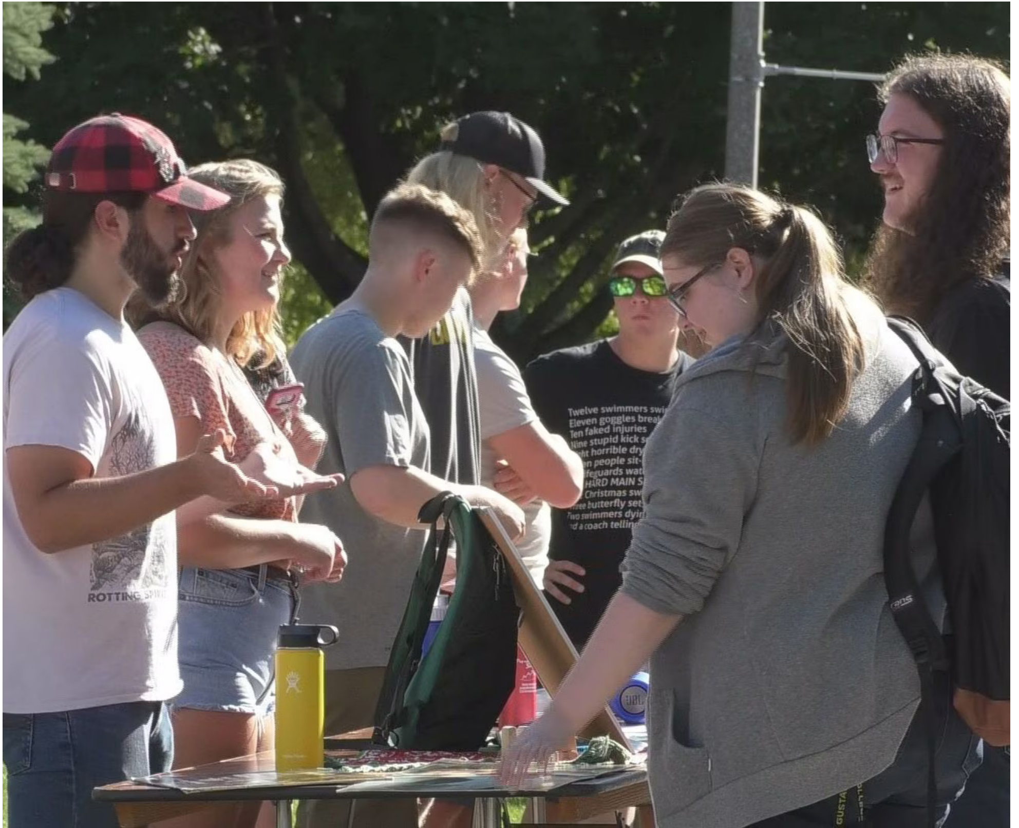
Students checking out a table at the involvement fair.