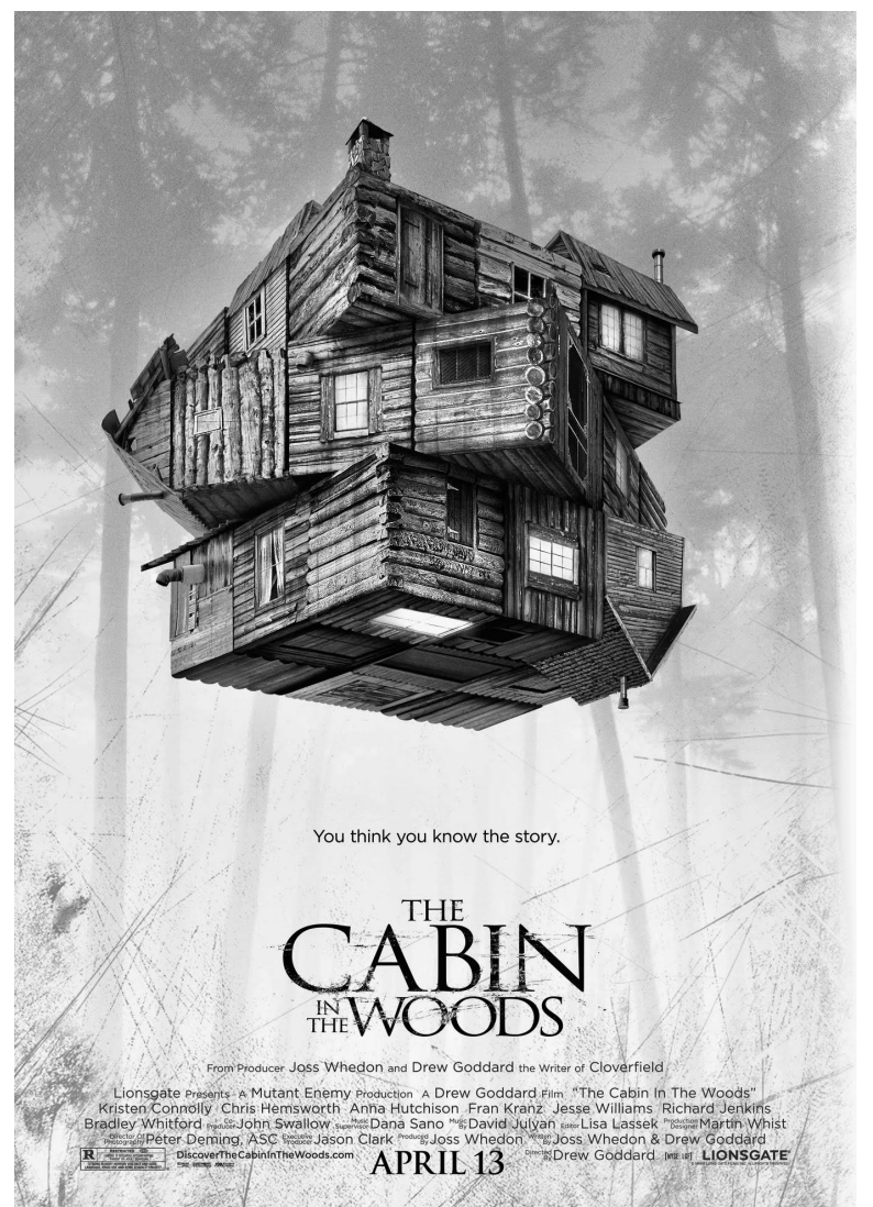
Cabin in the Woods Movie Poster

"Friday Night Frights" is an opportunity to "hang out after [the] first week of classes and