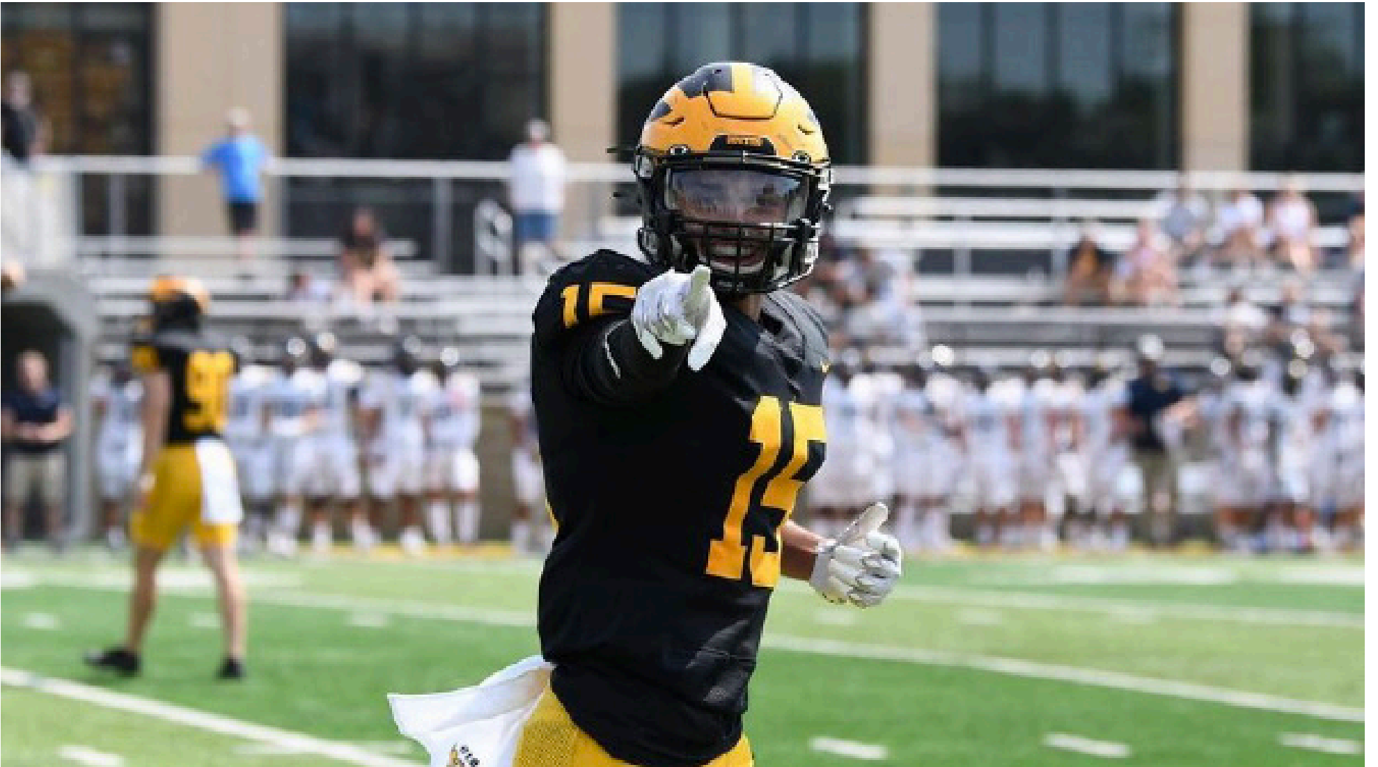
A picture of a Gustavus football player.