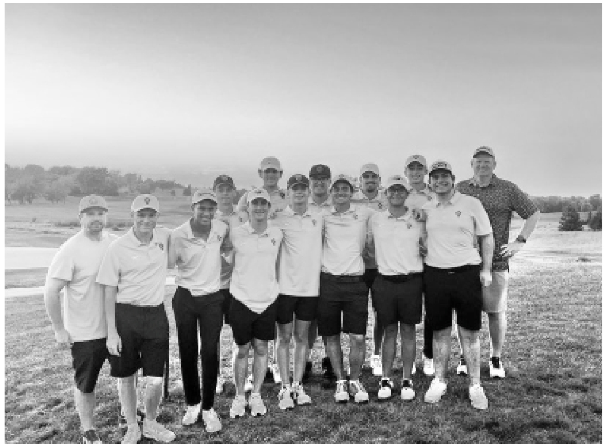
Gustavus Men's Golf Team.