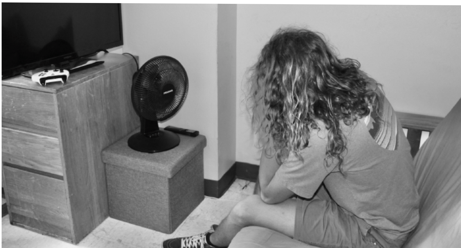
Student sitting in front of fan to cool dorm.

As the year marches forth, ever onwards to its inevitable end and inevitable next beginning, and as the cold does come for us as it does every year, we must take these warm days that are offered to us, and cherish them. But, we must also be mindful of our health, of how we feel as we traverse the sun-stricken landscape that befouls the air. Remember to wear light clothes, drink plenty of cold water, and make sure to hang out in or make cold areas that you can thrive in to fight off this horrid heat that we all face.