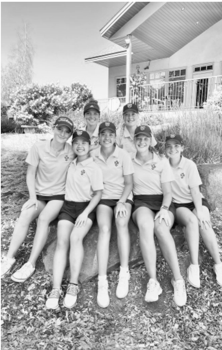
Gustavus Women's Golf Team.