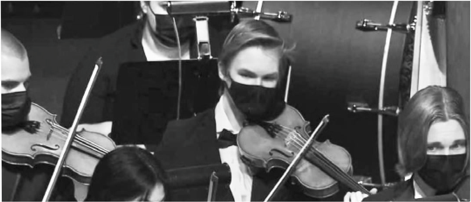
Student performing in band concert