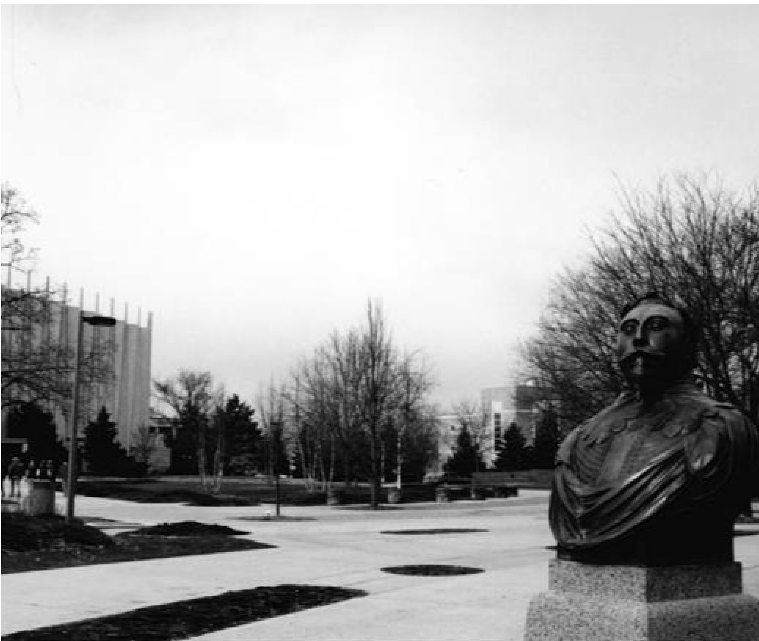
Students will be honored in Christ Chapel this weekend

Students are encouraged to attend the Involvement Fair this Tuesday to see what they can discover – either about themselves or about what the Gustavus community has to offer!