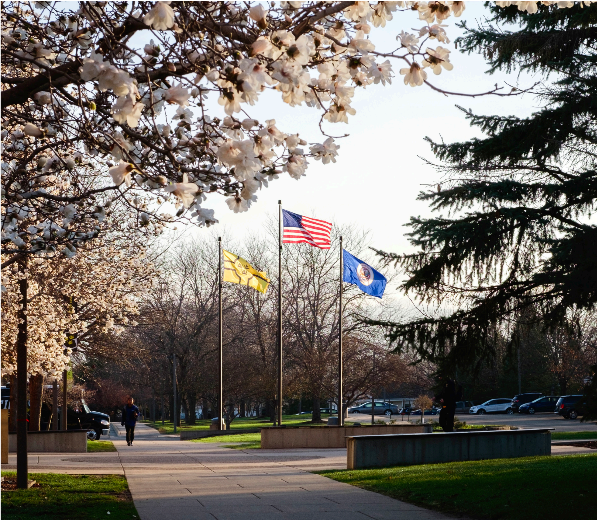
Three Flags beyond the blossoms