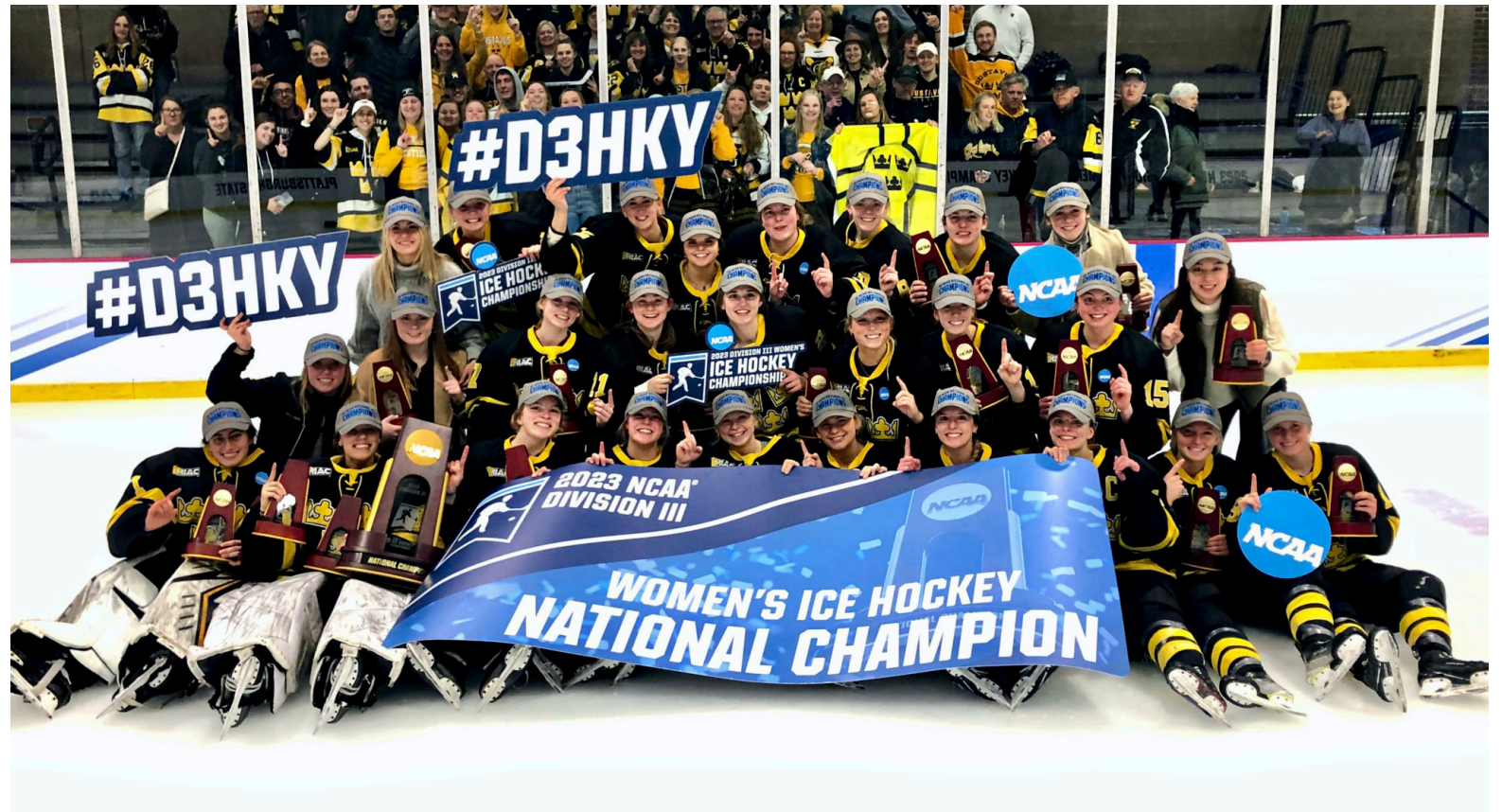
Women's hockey celebrates their win at Nationals

Over in the pool, the Gustavus swim and dive teams finished another successful season at the MIAC Championships. The men secured their fourth straight MIAC Championship while the women wound up finishing in second after some great swimming. In the Cham-