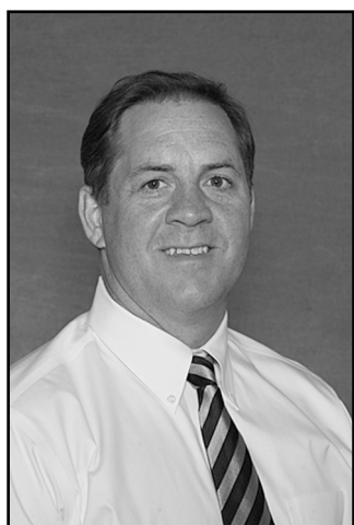
Gustavus Sports Information

The biggest challenges to success? "Being patient and keeping our focus on the small steps. We play in the finest league in division 3 in the country so