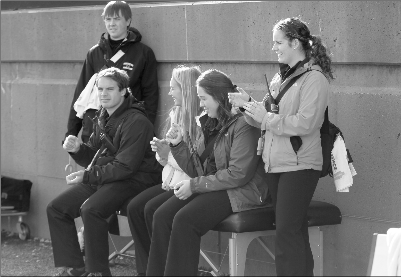
Gustavus Sports Information