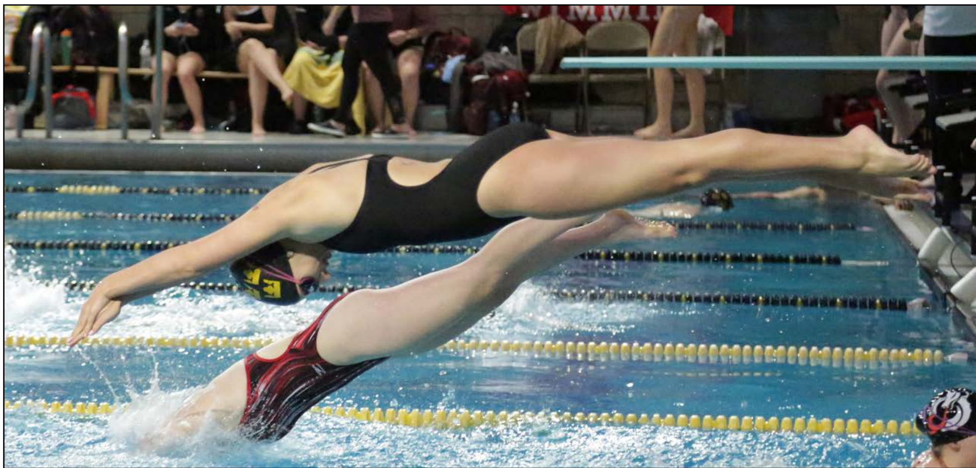
A Gustavus Swimmer jumps into the pool during a leg of a relay in the "Race for Grace" on Nov. 21st. The Women's team is looking to repeat as MIAC champions, as the Men's team looks for a piece of the action.