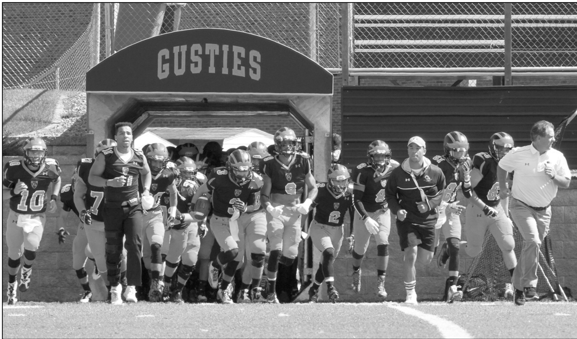
Gustavus Sports Information

Wins Gustavus' first MIAC Coach-of-the-Year award in football since 1987