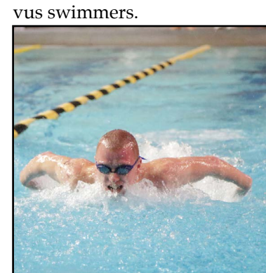
Gustavus Sports Information

Being around such great people makes the grind of early mornings and tough training much more enjoyable for the hard working group of Gustavus swimmers.