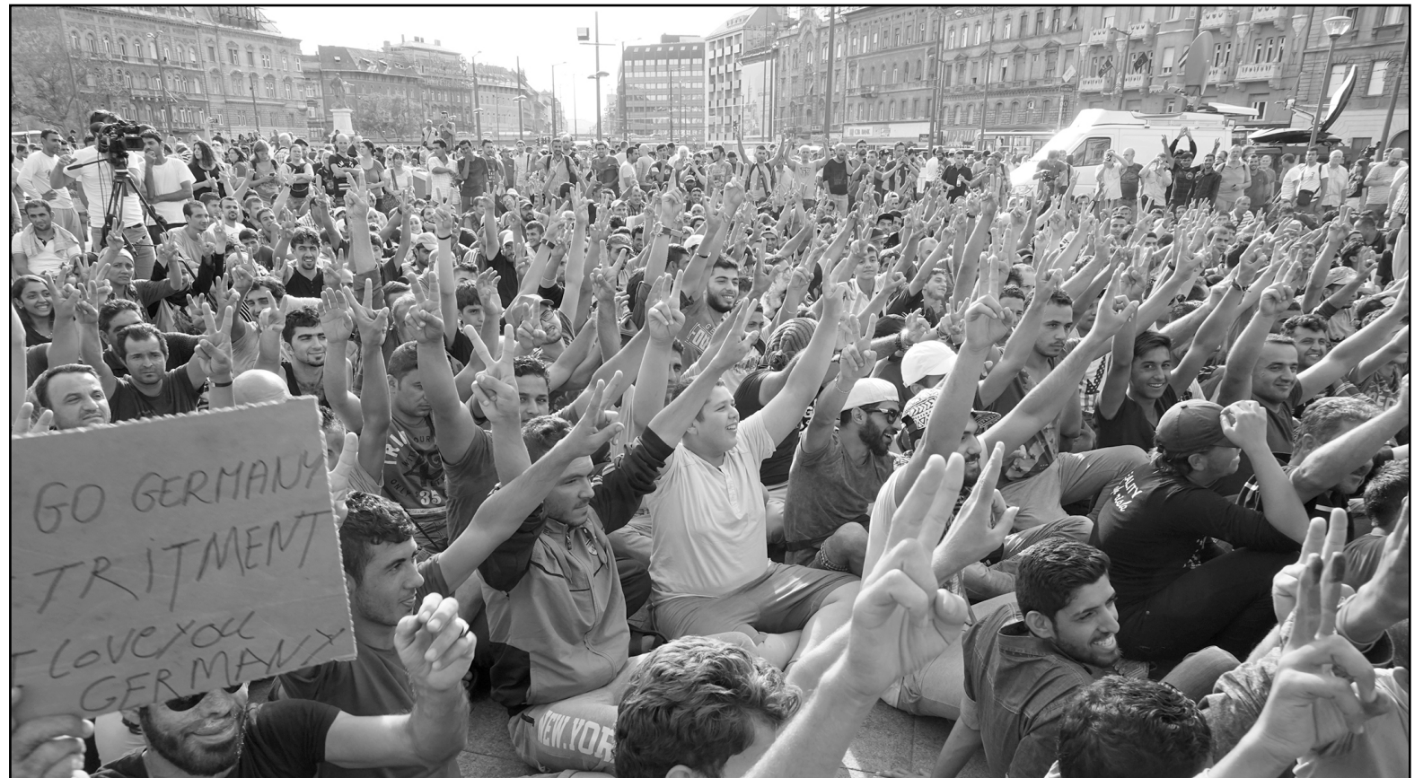
Refugees of the Syrian Civil War strike outside a main railway station in Budapest, Hungary.

The United States counter-terrorist and terrorism prevention forces are pretty d*** good, and the screening to enter the country is elaborate. We also aren't facing a flood of immigrants coming straight over our borders the way European countries are, we can handle a small influx of refugees. They aren't going to steal all our jobs,