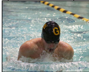
Gustavus Sports Information

season. The men are looking to improve from their fifth place finish in the conference last year, while the women are looking to repeat as conference champions.