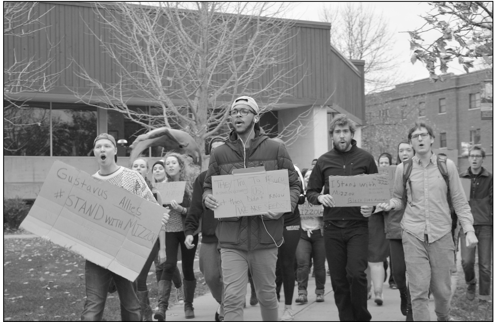
Gustavus students protesting on November 12th in solidarity with students of Mizzou who have been protesting racial issues on their campus.

My white privilege makes it possible for me to go my entire life without worrying about racism if I chose to. Yes, I would be happier if my friends of color felt safer and the police were held more accountable for their actions, but I can never even presume to understand what it