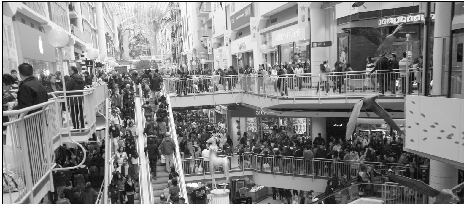
Boxing Day, the day after Christmas Day, is a hectic shopping holiday in Canada much like Black Friday in the United States.