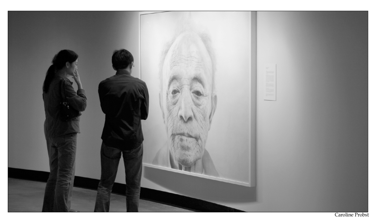
Visitors can view the stunning contemporary art of China in the latest Hillstrom Museum exhibit.

the rest of the tour. "The biggest challenge was to get museums in the U.S. to take on the exhibit because of the distance and challenges of taking on emerging contemporary art," Koivisto said.