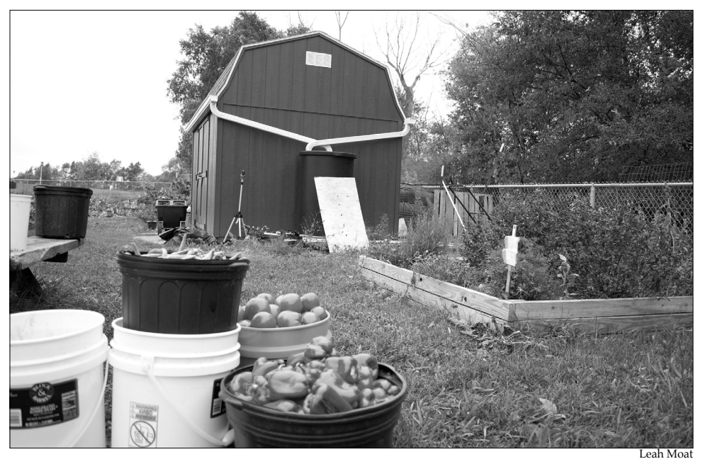
The Big Hill Farm grows a variety of fruits and vegetables, and student involvement is en-

location, but was relocated three years ago to its present place, by the west soccer fields parking lot. Most of the produce from the farm is given to the Caf and the surrounding community. Produce given to the Caf usually has a sign that says "Big Hill Farm" for students. Big Hill Farm grows a variety of vegetables and fruits grows a variety of vegetables and fruits. Some of the vegetable and fruits grown are, grapes, pumpkins, cantaloupes, watermelon, cucumber, melons, squash, tomatoes, and onions. Grapes have recently been added into the crop this year. These are all grown by the Farmers and the student volunteers who work at