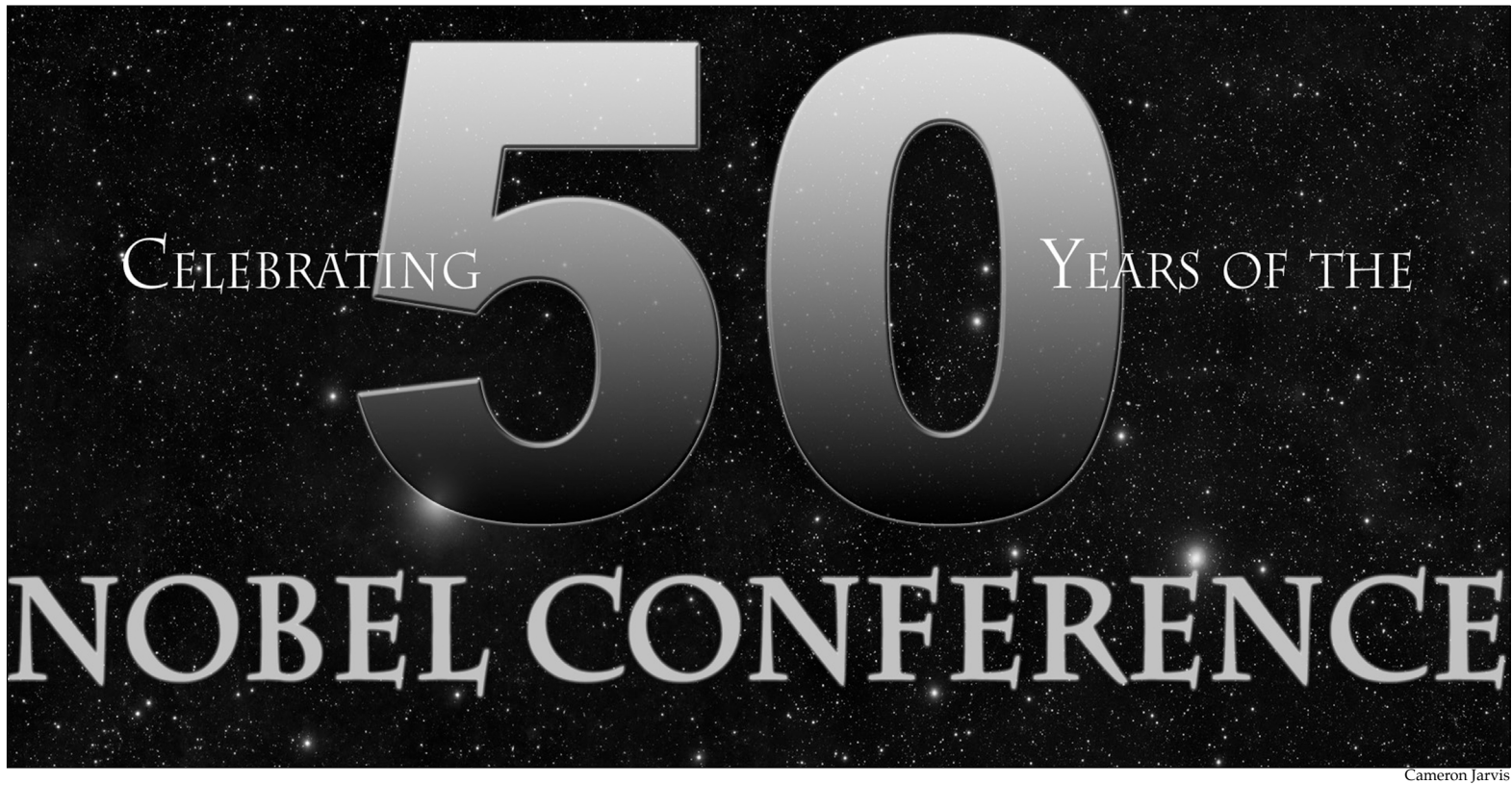
The Nobel Conference will recognize its 50th anniversary as audience favorites have been invited to return.

Topics over the past years have varied from oceans to economics of food and even aging. At the 50th Nobel Conference,