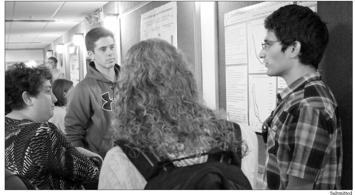
Students gathered during the 2014 Fall Research Symposium to share research experiences.